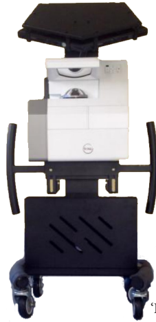
'Patent Pending – Application no. 61650032'